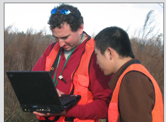
Connecting planning with emerging climate change science will enable planners and managers to effectively assess current management capabilities, reconcile management with scientific findings, and develop new management approaches to ensure the sustainability of forest resources.

TACCIMO utilizes a database of climate change forecasts, direct ecosystem impacts, and management options to generate customized reports that aid with forest planning and management. Users can choose issues of interest such as biodiversity, forest pests, forestland conversion, natural disturbances, precipitation and temperature variability, prescribed fire, recreation, silvicultural treatments, and wildfire. Based on user-defined selections, TACCIMO links direct and indirect effects of climate change with possible management options for lessening climate change impacts in targeted U.S. geographic regions.